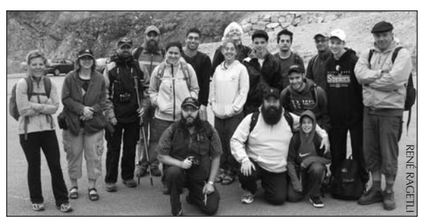
Participants had a chance to share Chassidic stories and get some exercise.

Billed as an intermediate trail by the organizers, the hike and down the mountain was a great accomplishment for many of the hikers. The terrain started off with